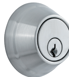
QDB288626 Key Control